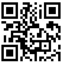
SK JAPAN Official HP

Contact us: https://skj-felicis.com/oem_odm/